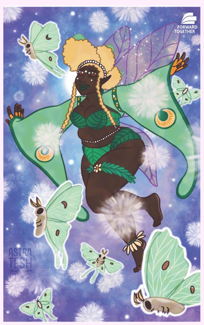
SOCIAL MEDIA: @ASTRATESH @ f WEBSITE: ASTRATESH.COM